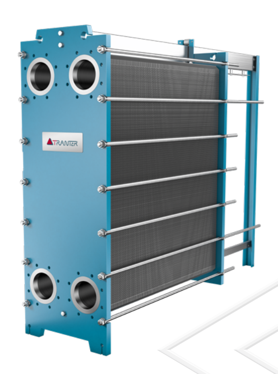
PLATE AND FRAME FOR MAXIMUM EFFICIENCY

OPTIMUM PERFORMANCE IS A PROMISE TRANTER, HAS BEEN FULFILLING FOR MANY DECADES WITH SUPERCHANGER PLATE AND FRAME HEAT EXCHANGERS. TRANTER SPECIALIZES IN PROVIDING HEAT TRANSFER SOLUTIONS IN ALL INDUSTRIES. OUR COMPLETE ENGINEERING AND MANUFACTURING EXPERTISE BRINGS YOU FOULPMENT THAT MEETS THE HIGHEST STANDARDS OF DESIGN EXCELLENCE AND QUALITY WORKMANSHIP.