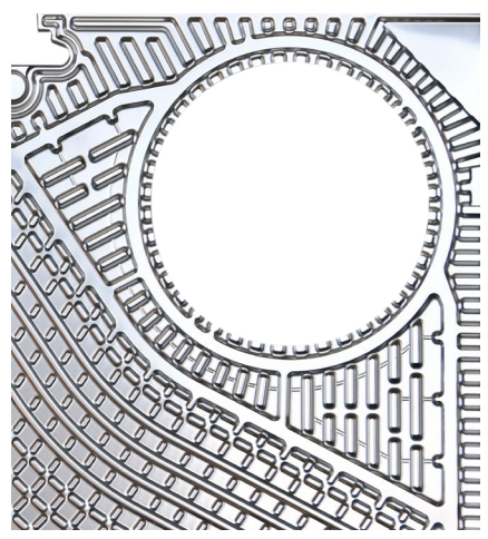
Fig. 5: The plate edge and port structure exhibits exceptional strength for impressive unit integrity.