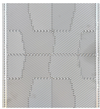
Fig. 3: The OmniFlex<sup>™</sup> heat exchange zones induce high turbulence and enhanced heat transfer rates, yet with low pressure drop

balanced flow across the plate—this achievement reserves the bulk of the exchanger pressure drop for the heat exchange area (Fig. 2). Our unique OmniFlex<sup>TM</sup> (patent pending) heat exchange zones improve mechanical contacts and ensure that every part of the heat transfer surface is utilized to induce high turbulence and enhanced heat transfer rates yet with low pressure drop (Fig. 3). The OmniFlex<sup>TM</sup> pattern also results in improved plate flatness that ensures consistent quality.