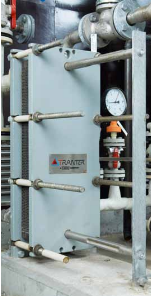
Tranter PHE Model GCD-016 The heat exchanger transfers heat energy from Stage 4 flue gas condensate to district heating water.

Two other heat exchangers complete the condensate heat recovery and cooling process. A Tranter PHE Model GCD-016 heat exchanger uses district heating water as cooling media for the Stage 4 flue gas condensate. A GLD-013 unit uses