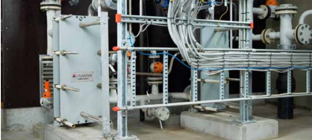
Tranter PHE GCD-016 and GLD-013 units recycle heat from upper scrubber stages and cool process water for temperature-controlled outflow.