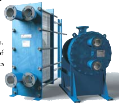
Tranter plate HE technology, represented by the SUPERCHANGER® Plate & Frame and the SUPERMAX® Shell & Plate units, makes space-efficient use of low-grade cooling streams in condensate sub-cooling service.

Utilities are finding that replacing shell & tube exchangers with Tranter Welded Plate Heat Exchangers (WPHEs) installed downstream of the condenser eliminates the flashing and backpressure during the hot season. The exchanger's efficient plate technology results in a small footprint than traditional shell & tubes. The increased turbulence of plate technology promotes